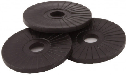
Plastic washers for legs