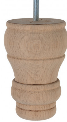
Example of Furniture legs with M8 fixing. You can source furniture legs to your taste.